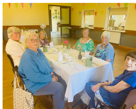
Dial-a-Ride members at the tea.